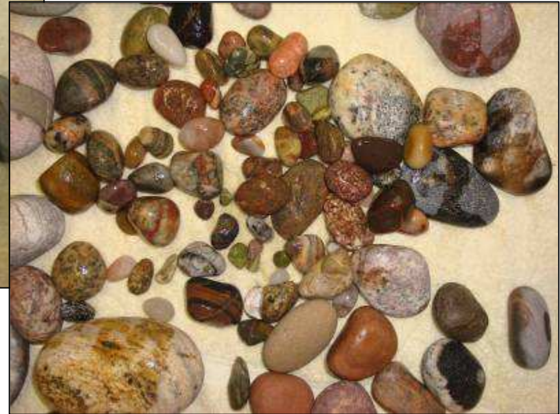
Close-up of the little stuff