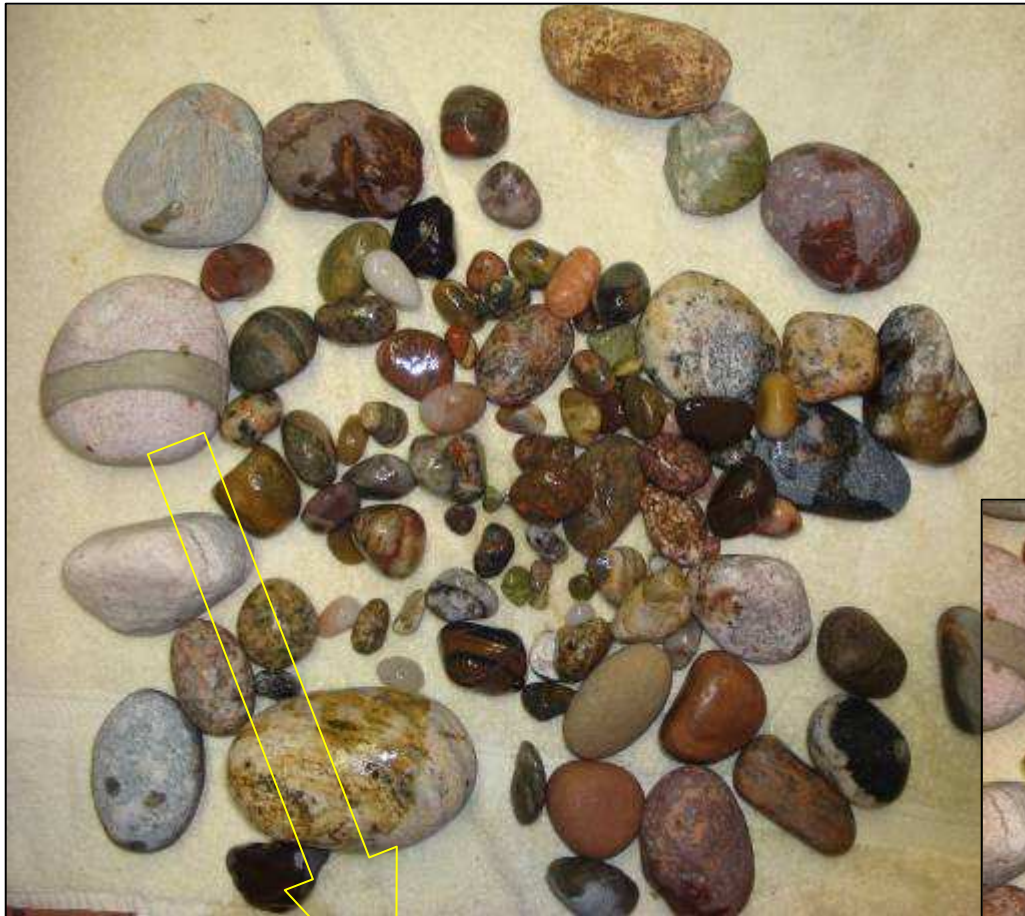
Rocks from the beach at Whitefish Point