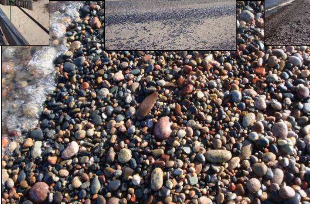
Lake Superior beach (above)