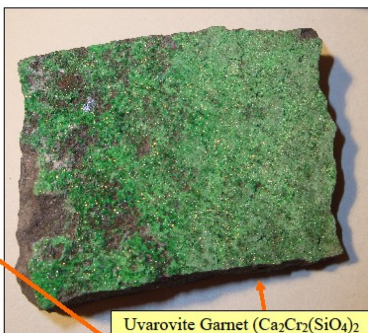
Uvarovite Garnet ( \text{Ca}_2\text{Cr}_2(\text{SiO}_4)_2 ) Saranji, Ural Mts., Russia