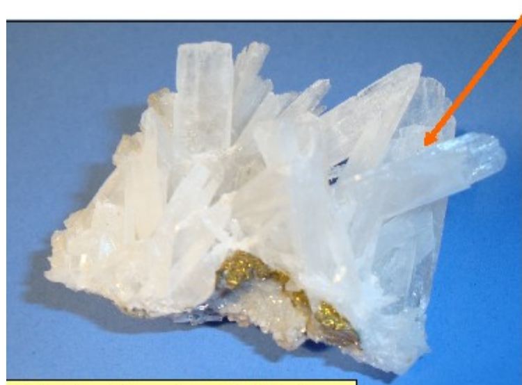
Celestine (Strontium Sulfate) Stoneco Quarry, Clay Center, OH