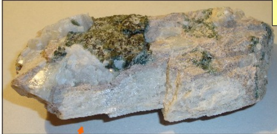
Wollastonite [ \text{CaSiO}_3 ] Pitcairn, NY