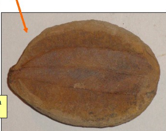
Fossil of Lepidostrobophyllum maybe from Mazon Creek, IL