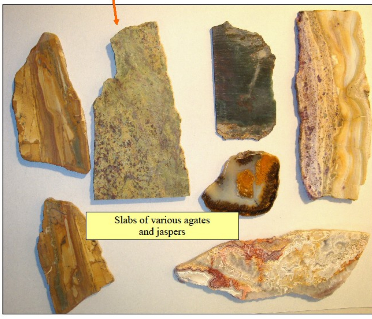
Slabs of various agates and jaspers