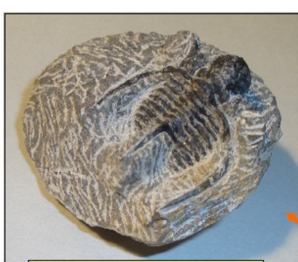
Trilobite (Cephaspis) Devonian Merakib, Alnif, Morocco