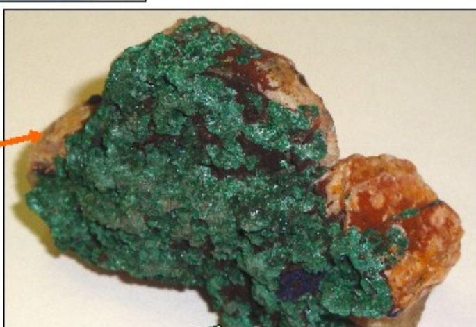
Malachite \{\text{Cu}_2\text{CO}_3(\text{OH})_2\} on Quartz w/ Azurite \{\text{Cu}_3[(\text{OH})(\text{CO}_3)_2]\} inclusions