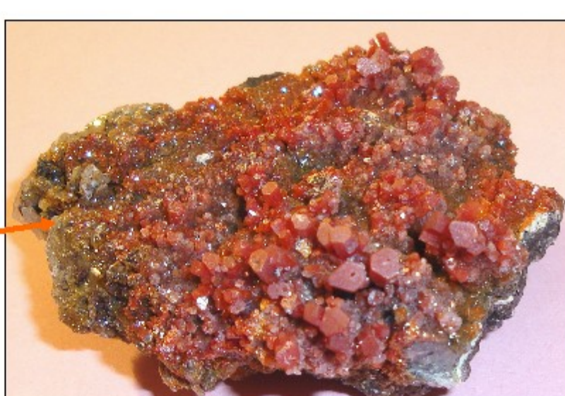
Vanadinite [ \text{Pb}_5(\text{VO}_4)_3\text{Cl} ] Trigo Mtns., Arizona