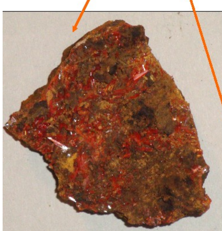
Crocoite ( \text{PbCrO}_4 ) Tasmania, Australia