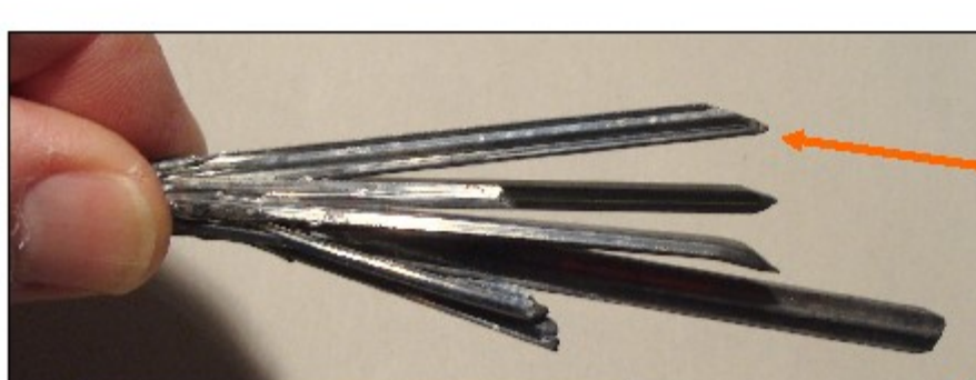
Stibnite (Antimony Trisulfide) Wuling Mine, China