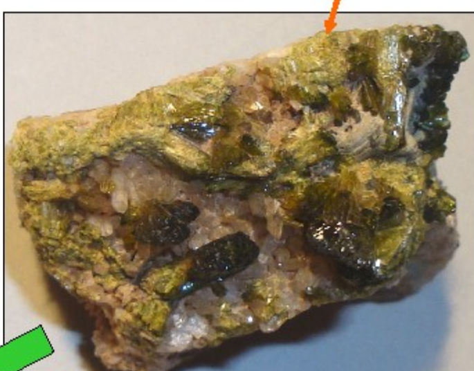
Epidote (calcium aluminium iron sorosilicate) and Quartz ( \text{SiO}_2 ) Anti-Atlas Mtns., Morocco